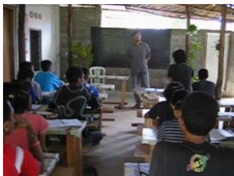
Student shares her ideas with Teacher

More topics are being discussed to develop our students' positive character.