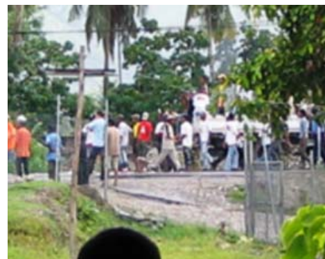
Demonstrators resting in front of the school.

Breakfast entertainment is an opportunity to experience live morning news. As gangs are a determined lot, they would sometimes continue their night fights in the morning. Traffic would stop and sirens from either the ambulance or the police cars would turn curious heads. On special days, we get to see a parade full of people in trucks joyfully singing and waving colorful banners and flags heading to the government's house. All united in demanding justice and human rights.