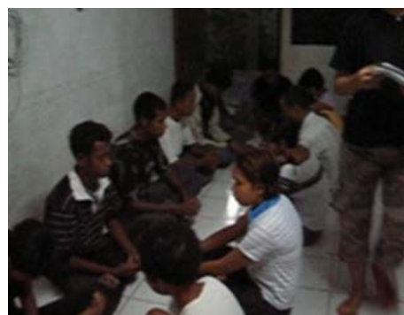
Sitting in meditation position

SOLS 24/7 is very particular about the effectiveness of our programs and that was why the method of counting beans was corrected immediately after teachers saw that students were not following the rules of counting beans. Done properly, students will be able to attain better concentration and focus, which will help them progress faster in their studies and work. The right way of counting beans is more tedious and challenging but it would produce more effective results in the long run.