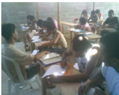
Students taking their monthly English test

Students improve on their usage of verbs, verb-to-be, past and future tense.