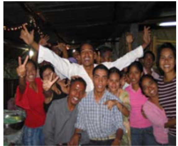
Smiles at our first Nawruz Party

Sumptuous food was served at the party and 2 performances were put up, showing our students' hidden acrobatic talents and hip hop moves. Guests were definitely entertained as they cheered for our students and laughed at their silly moves and antics. Then it was time for everyone to swirl and twirl to jovial Portuguese and Timorese music on the dance floor. Timorese dance in partners and this makes dancing a rather lovely affair.