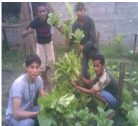
Students picking vegetables

Students enjoy sawi, Chinese kale and water green from our fields.