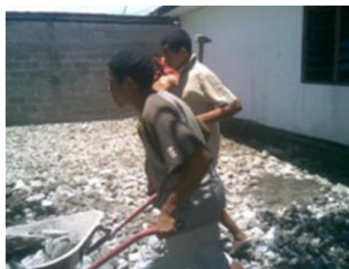
Laying the foundation of the new classroom

A new plant propagation area was build to propagate some plants that we would like to grow in the school garden and at our agricultural field. It only took one day to build the propagation area. We are also planning to construct a new classroom so we can open new part-time classes. Students and teachers have been busy transferring stones and soil to lay the foundation of the class. Once it finishes, we are ready to open new part-time classes and provide more service to East Timorese.