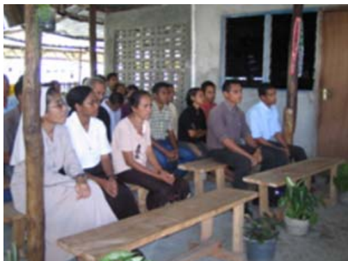
Get-to-know community meeting

The spirit of unity continued as our students welcomed priests, nuns, community members and students' parents to come and have an orientation of the school and get to know more about the school's program.