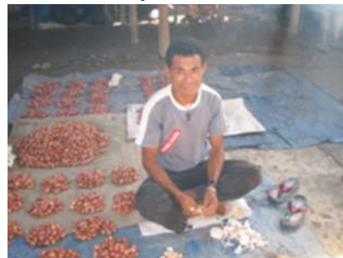
Shot of man at market taken for the video

The shooting of SOLS 24/7 East Timor first institutional video started in late March. Our all-in one director-producer-editor-actor-cameraman and voice over, Excellence, excitedly went around the school to capture students' attending the school program and activities. Repeated shots of the school had to be made to perfect the quality of the video and Excellence had spend nights editing the video.